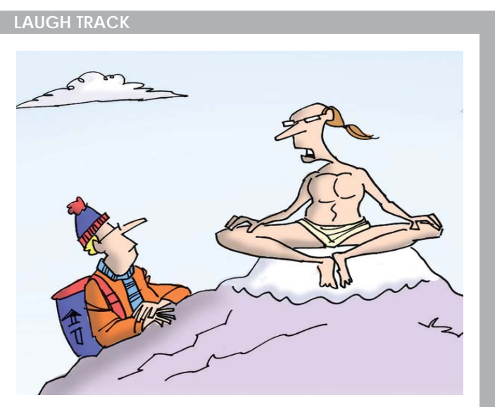
Enlightenment and inner peace are on the next hill. I explain the U.S. standardization system.

The roadmap's recommendations for closing standardization gaps in the nearterm (0-2 years), mid-term (2-5 years), and long-term (5+ years) are intended to map